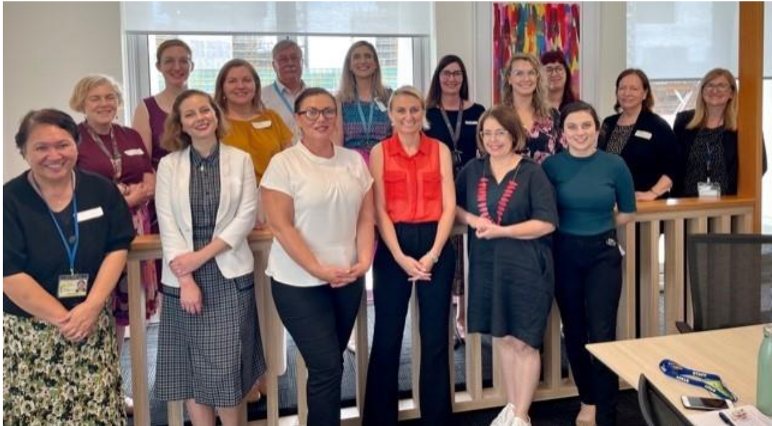
Joining our colleagues from the Queensland Integrity Commission and Queensland Family and Child Commission for a Leading Women's Network Hub Event | 15 November 2021