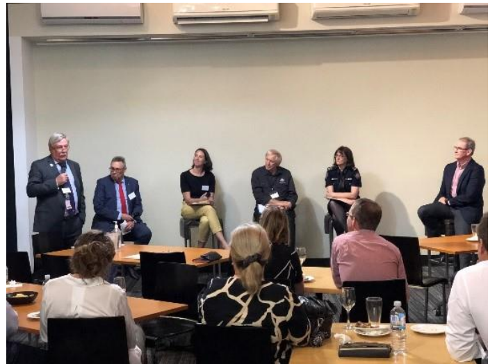
Flood Resilience Symposium at the Griffith University Disaster Management and Resilience Facility | 18-19 October 2021