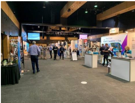
LGAQ Conference | Mackay 25-27 October 2021