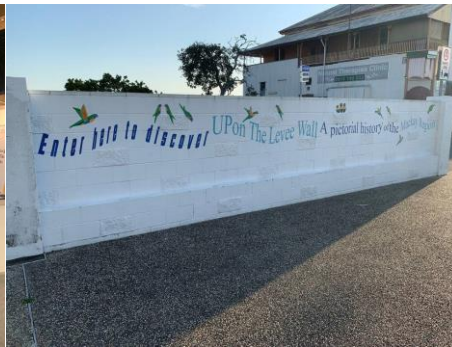
Pioneer River Levee bank extension within the Mackay Community Gardens in Sarah Street, West Mackay