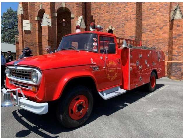
Firefighters Remembrance Day at St Brigid's Red Hill, Brisbane to honour those who have lost their lives protecting others 10 October 2021