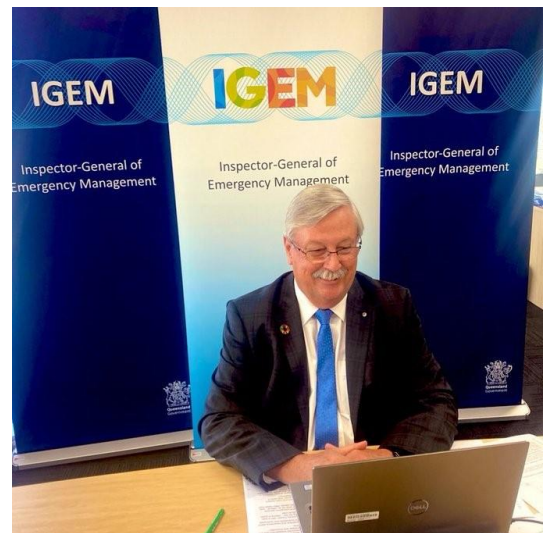
Closing panel for AFAC2021 7 October 2021