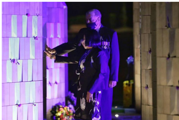
National Police Remembrance Day Candlelight Vigil 28 September 2021