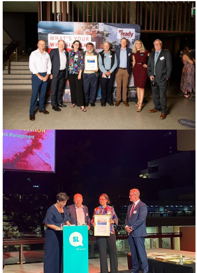
Happy Valley Rural Fire Brigade and Happy Valley Community Association won a 2021 Resilient Australia Award for Queensland on 6 October 2021