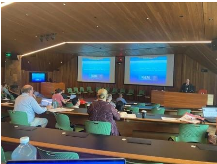
IGEM spoke at HEAL2021 Conference about key challenges in disaster management 18 November 2021