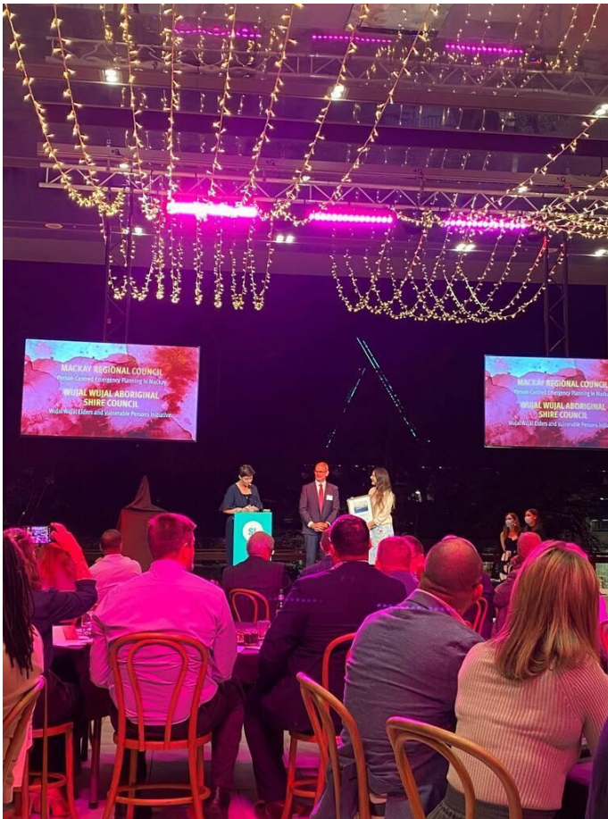
Mackay Regional Council and Wujal Wujal Aboriginal Shire Council were joint winners in the local government category at Queensland's Resilient Australia Awards on 6 October 2021